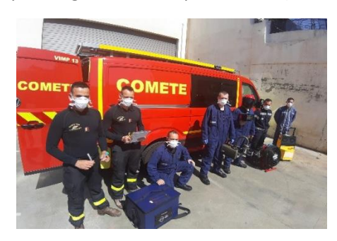
Members of COMETE team

SARS-CoV-2 from air samples, on surfaces and in Humans. In the framework of its collaboration with the BMPM, C4Diagnostics has developed a protocol for sample collection, sample preparation and detection of SARS-CoV-2 from wastewater, by RT-PCR (detection limit of 100 genomic copies/ml, corresponding to 100 viral particles/ml).