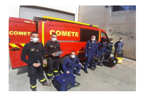
Members of COMETE team

C4Diagnostics, a French biotech company expert in designing, developing and marketing diagnostic solutions for infectious diseases, had previously developed a range of solutions for the detection of SARS-CoV-2 from air samples, on surfaces and in Humans. In the framework of its collaboration with the BMPM, C4Diagnostics has developed a protocol for sample collection, sample preparation and detection of SARS-CoV-2 from wastewater, by RT-PCR (detection limit of 100 genomic copies/ml, corresponding to 100 viral particles/ml).